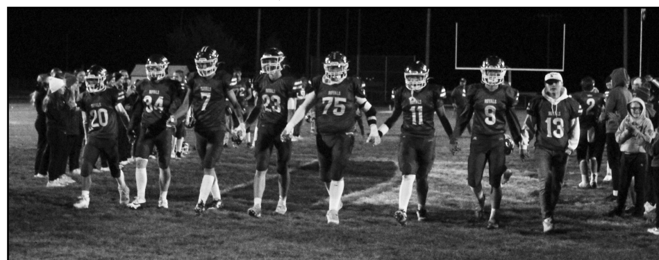
Royal Seniors take their walk down the field with a tunnel of supporters after Royals victory during first round playoffs home football action held Friday against Logan-Magnolia in Marcus.