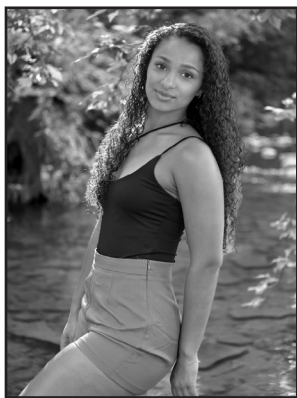
Senior Spotlight By: MMCRU Communications