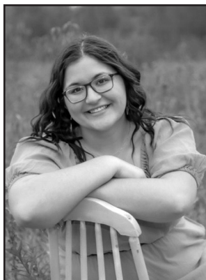
By MMCRU Communications